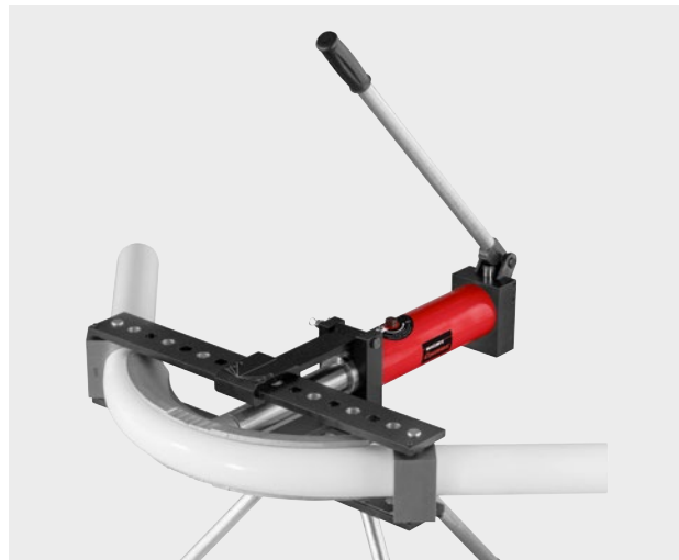
German Top Quality