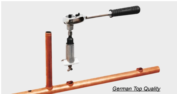
German Top Quality