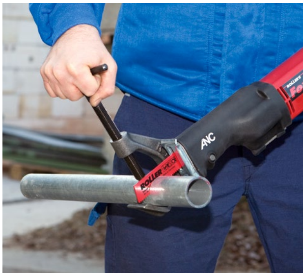
German Top Quality