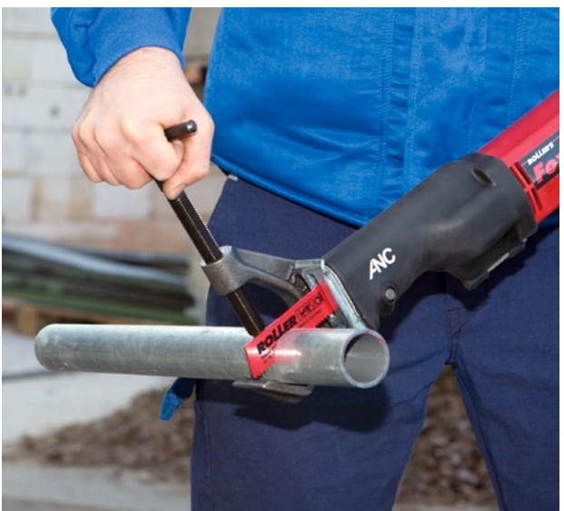
German Top Quality