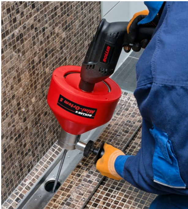
German Top Quality

Robust, handy electric pipe cleaning device with fast switchover for automatic spiral feed and return, for pipes up to Ø 20–50 (75) mm, for pipe cleaning spirals Ø 8 and 10 mm.