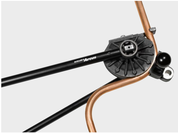
German Top Quality