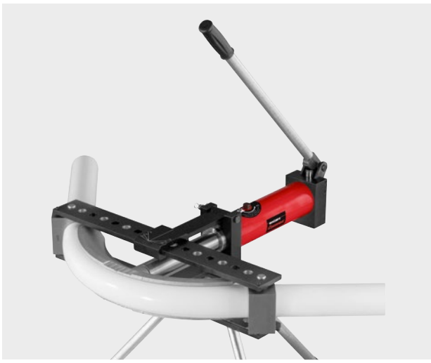
German Top Quality