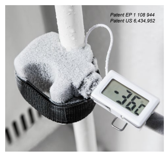
German Top Quality