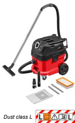
Dust class L