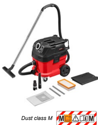
Dust class M