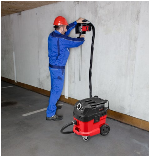
Extraction of health hazardous dusts when chasing and cutting