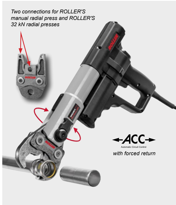
Two connections for ROLLER'S manual radial press and ROLLER'S 32 kN radial presses

←ACC→ Automatic Circuit Control with forced return