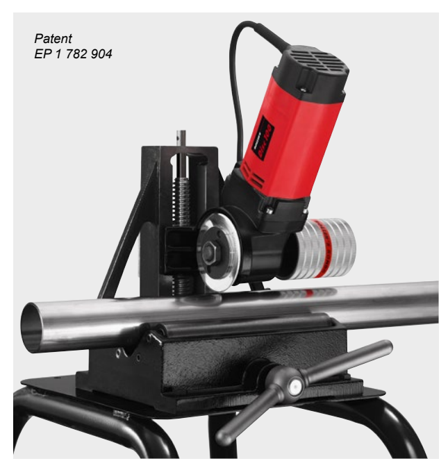
German Top Quality