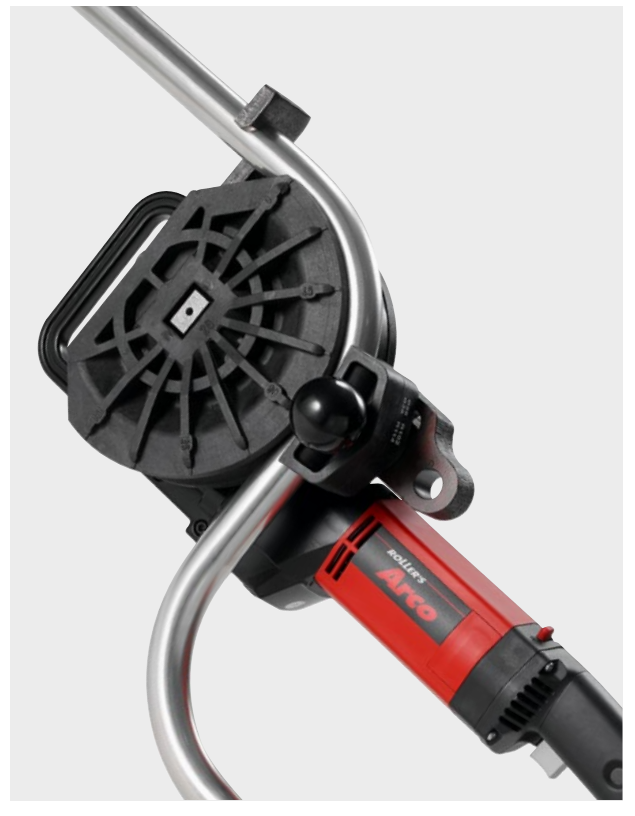
German Top Quality