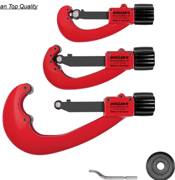
German Top Quality

Small, handy pipe cutter for thin-walled, stainless steel tubes, copper tubes and others, Ø 3–28 mm, Ø 1/8–1 1/8", wall thickness s ≤ 4 mm.