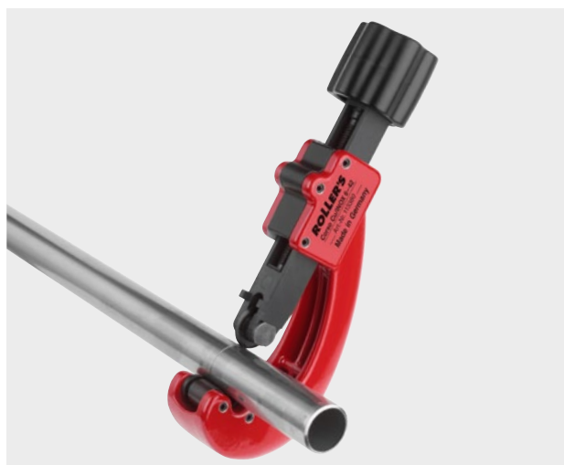
With telescopic spindle