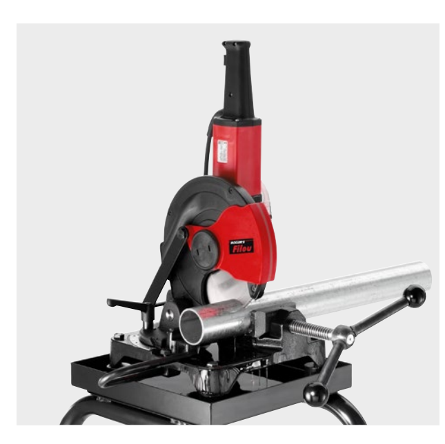
German Top Quality