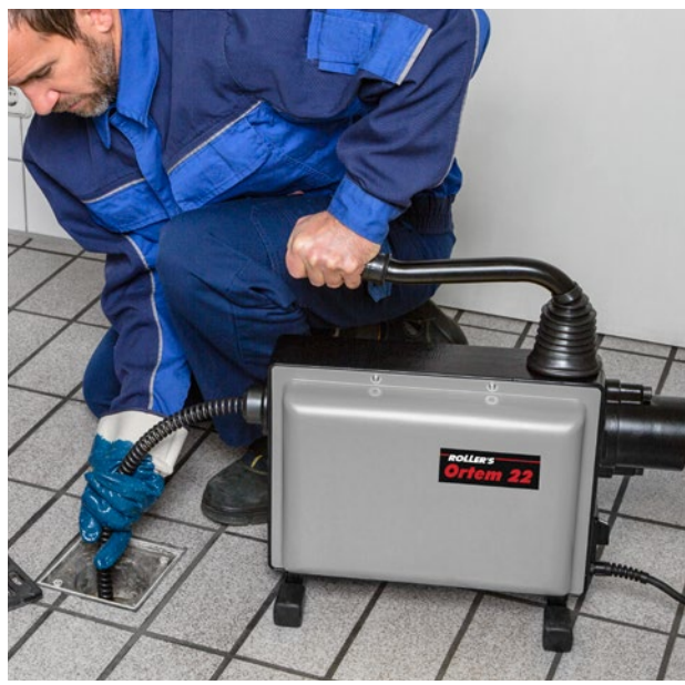
German Top Quality