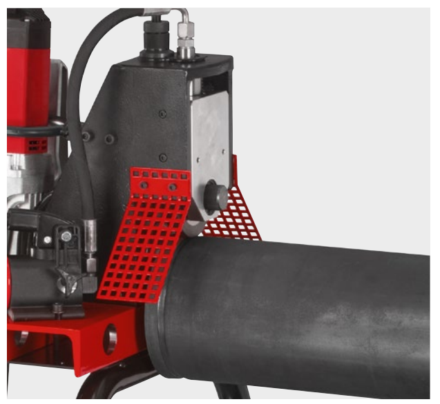
German Top Quality