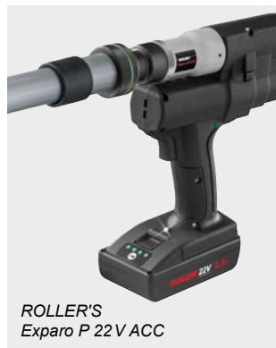
ROLLER'S Exparo P 22V ACC