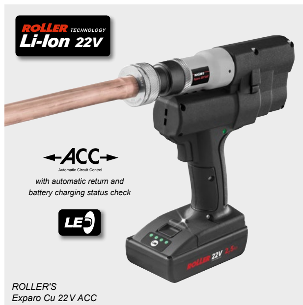
ROLLER'S Exparo Cu 22V ACC