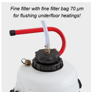
Fine filter with fine filter bag 70 \mu\text{m} for flushing underfloor heatings!