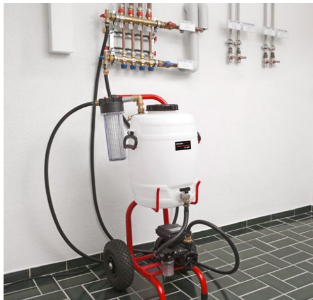
German Top Quality

Powerful electric filling and flushing unit for fast, easy filling, flushing and venting of closed systems.