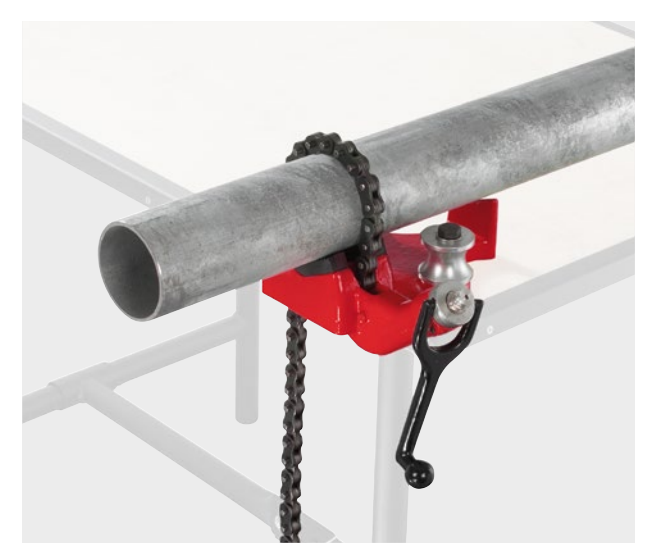
German Top Quality