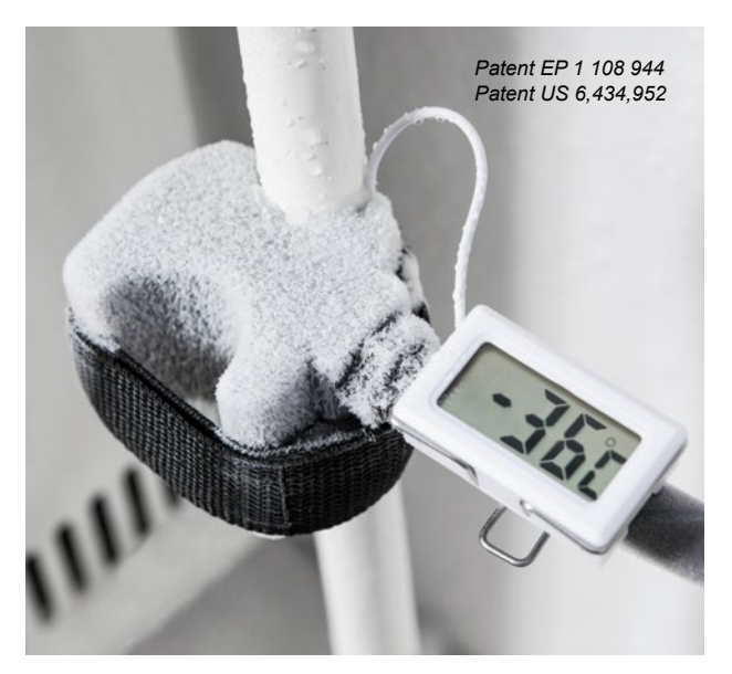
German Top Quality