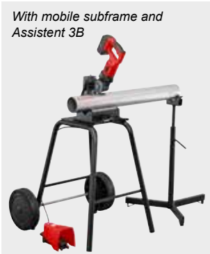
With mobile subframe and Assistant 3B