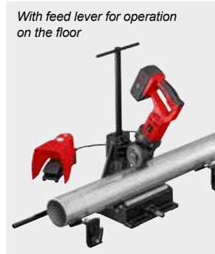
With feed lever for operation on the floor