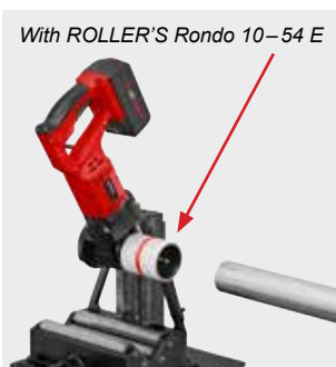
With ROLLER'S Rondo 10-54 E