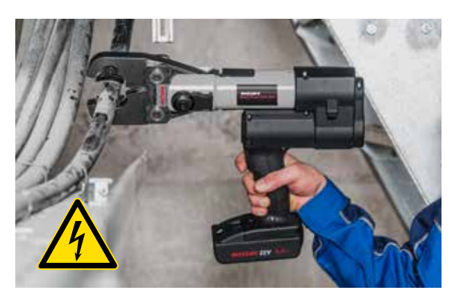
German Top Quality