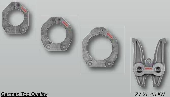
German Top Quality

ROLLER'S pressing rings VMPz XL with system-specific press contour according to the pressfitting system Viega Megapress S XL. For perfect system-conformant, reliable pressing.